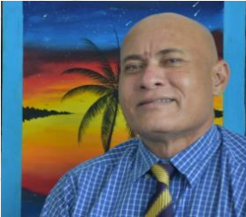
Hon. Seve Paeniu Minister for Finance

I am pleased to present Te Kete on behalf of the people of Tuvalu. Te Kete is the platform upon which we are able to overcome the socio-economic challenges and environmental crises in this period of the “new normal” we are now experiencing. Moreover, the Coronavirus pandemic has challenged our nation to think beyond the box and to resolve the unexpected associated crisis so our people can continue to live sustainable and satisfying livelihoods.