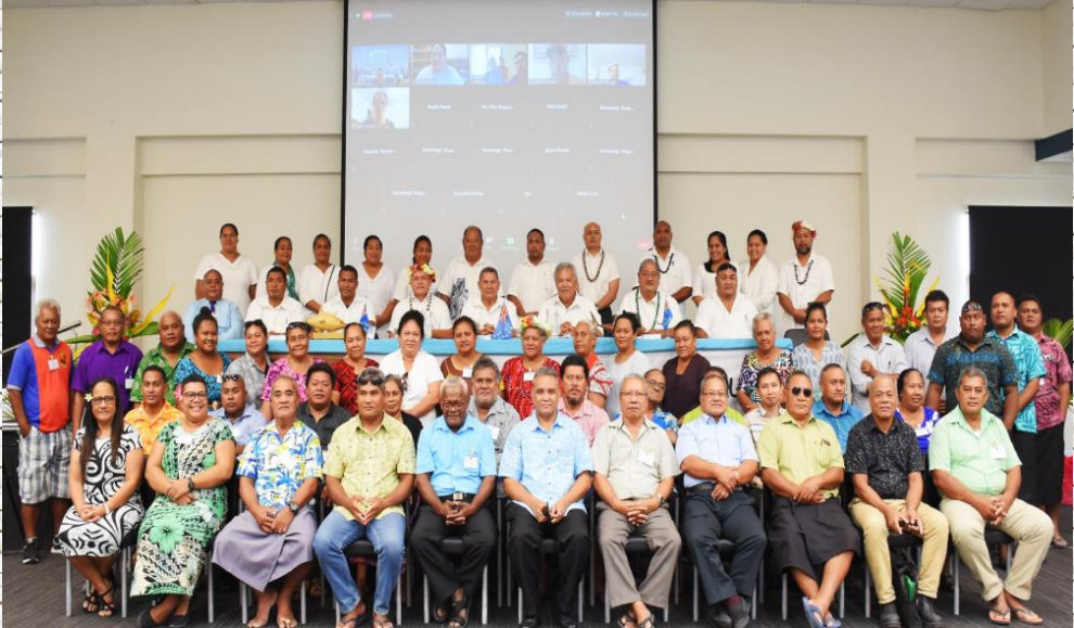
Figure 2: Group photo of the National Summit on Sustainable Development, 5 th November 2020